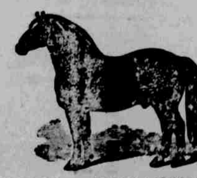
PERCHEON AND MORGAN STALLION.

TERMS—$7.00 to insure colt to stand and suck.