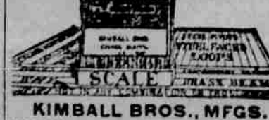
KIMBALL BROS., MFGS., 1051 9th St., Council Bluffs, Ia.

Here is a pleasant story which has never appeared in print, but is known to be true. The poet, Walt Whitman, was, as is well known, dependent during most of his life upon the kindness of his friends and admirers for support.