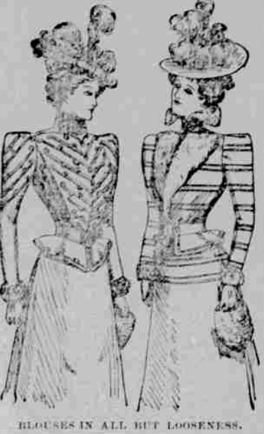
BLOUSES IN ALL BUT LOOSENESS.

face, and the fitting and shaping don in fur is simply wonderful. Coming to details of the three show here, there is in the picture diagonally opposite to the redingote already described an exquisite cape of dull gray pique de soie. It was finished with mouflon and bow-knots and wavy ends of silver ribbon were applied on it