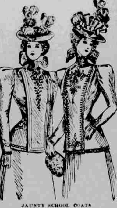
JAUNTY SCHOOL COATS.

more wholesome, healthy look. Such a garment, we argue, makes quite as good a background when slipped back as does the long cloak, and it is a deal more dainty before it is slipped off. To be sure, the young matron with a lovely figure to consider may prefer a down-to-the-heels redingote, richly trimmed with fur and with big sleeves and armholes, to either the long, loose opera cloak or the short, saucy cape. Such a