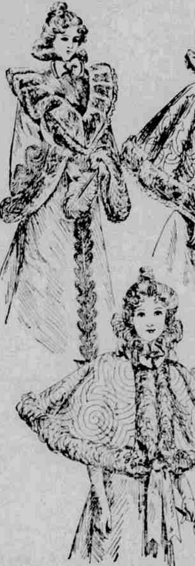
BIRDS OF VERY FINE FEATHERS.

All questions of cost aside, there are many reasons for preferring a cape to a long, loose cloak, handsome and rich as the latter is. The short cape has a