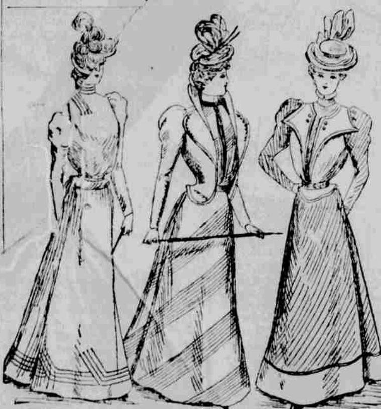
ONTEASTING PLAINNESS ABOVE THE BELT OUTDOORS.

pears above the storm collar glistens furs. - bit warmer than this sevenand colls without either stiff straight. Set is the blouse put at the opposite ness or untidy frizzle. The older sister, side of the illustration, but it was in may have more money spent on per coat form, the coat likeness coming in and may have more time to cor no the turned-back revers. The model