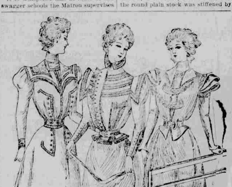
ELABORATENESS THE AIM FOR INDOOR BODICES.

Blouses for the street may be as plain skirt being a wool as you like and are ordinarily made so len plaid of large but dull colored plain that relationship to indoor squares. These skirts either just es blouses is not at all clear. Some of cape the ground or just touch the arch- the models are fairly austers. Such a ed instep as she walks. They are lined, one comes first in the three the artist If the wearer is lucky, with silk of a shows and was sketched in nut-brown, of Victor Hugo's books are found in I bright color, and how quick the customere. It fastened on the shoulder, young girls catch on to the fashlon- the little pleats necessary to take in the some of them are already fined with fullness at the neck were covered by n few rows of narrow braid, each fin It is whispered that at some of the Ished by a little loop and button, and