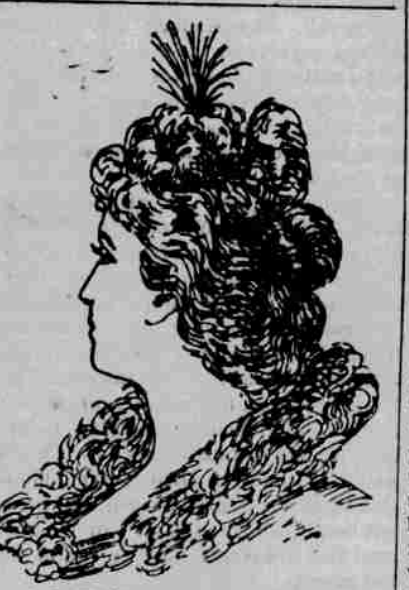
A PACE MADE TO BERM LONGER.

abolishment of cosmetics, but merely to point out how the skilled manipulator utilises its trickery. Women follow pretty closely the laws laid down by Dame Fashion for their attire, but as to face and hair, every woman parting, and the "Miss Prim" style for the hair. Still, the girl with an irreg-