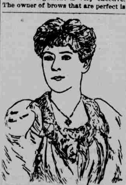
AT HER BEST WITH HAIR TOUSELED. not moved by it, naturally enough, but the other sort thinks it a telling one. Returning again to the point where women are much inclined to make each her own fashions—that is, the hair—it age is vigorous. He lives with his in- will be found that the style now is to either draw the locks smoothly up very high or to have it is a low knot, parted

So far the steps of progress have been of even length, but the next one is a stride at which many will falter. But the knowing ones take it and claim that it is but right, if the eyebrows give out of a sudden at the outer corner, or their arch be interrupted, to finish out what nature intended by shadowing in what is needed with a bit of burnt match. This is very different from vulgarly tracing a heavy black mark over the arch of the brows, they will tell you; the one is necessary and therefore excusable for the footlights, the other is as legitimate for all other times as wearing a best gown or putting on a bow of becoming ribbon. And this argument is very effective.