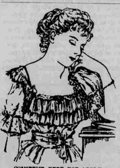
COSMETICS NEED NOT APPLY.

There is yet another thing; why should the pale woman with brown hair allow her cheeks to grow hollow and