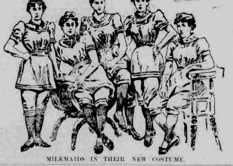
MILKMAIDS IN THEIR NEW COSTUME.

Make a Pair of Leggings. A little time and ingenuity will enable one to cut a pair of leggings. Take a stocking the right size and cut a pattern by it of old muslin. Baste and fit this to the leg, allowing enough for good seams. When a desirable fit is secured cut a pattern by it and save it for future use.