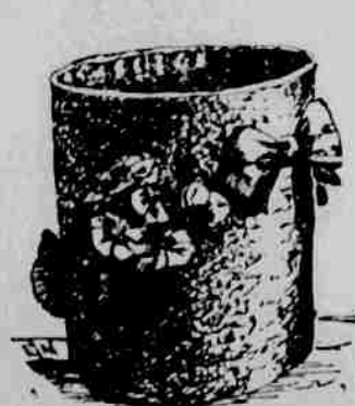
PRETTY WASTE BREKET.

to put them on smoothly, the result will reward the pains; the blending of color is beautiful. Make the lining, by seaming, and gathering with a little ruffle at merest edge will show. If you have and turn into molds. saved from last fall's blooming some bunches of hardy hydrangeas, these, or means of a jet of gas or a kerosene some modest colored artificial flowers, tamp burning low; thing impoverishes secured by the ribbon tied in a loose the air sooner. Use sperm candles or bow at the side, will make a very pretty tapers which burn sperm oil. ornament. It is a beautiful receptacle for tall grasses, if you should wish sometimes to use it as a bouquet receiver in a corner of the room.