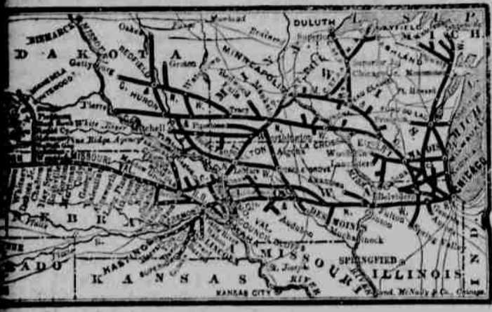
Map of the Elkhorn System.

is still a large amount of GOVERNMENT LAND open to entry in