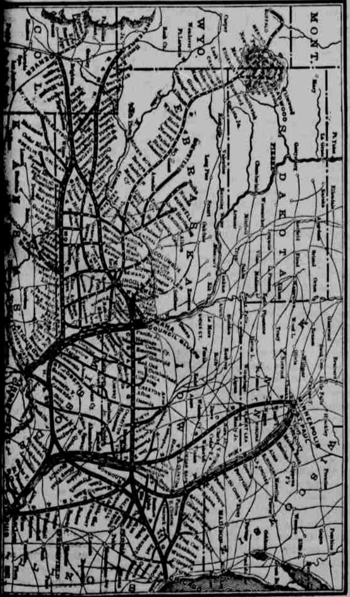
85 Miles of Railroad.

alone, makes it possible for a man to improve a piece of land with a small outlay of cash than he could have done in other parts of the state.