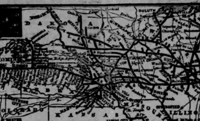
Map of the Elkhorn System.

There is still a large amount of GOVERNMENT LAND open to entry in