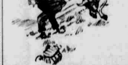
Angler—Hush! Keep back! Keep back! I had a beautiful rise just then. I shall get another directly.—Punch.

She Let Him Swing. "Willie," she cried from the window, "you two boys get right out of that hammock. The first thing you know you will break it down."