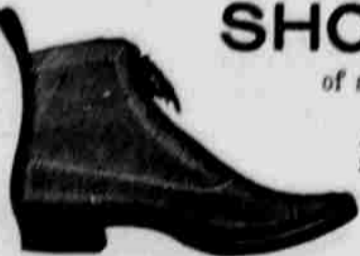
Best Goods to the market.

LADIES' SHOES worth $5.00 will go at $3.75 " " " " 4.00 " 3.00 " " " " 3.50 " 2.50 " " " " 3.00 " 2.00 MEN'S SHOES " " " 4.00 " 3.00 " " " " 3.50 " 2.50 " " " " 3.00 " 2.00