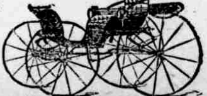
"A" Grade $72.50