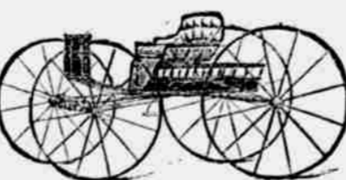
"A" Grade $35.