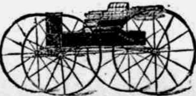
"A" Grade $46.