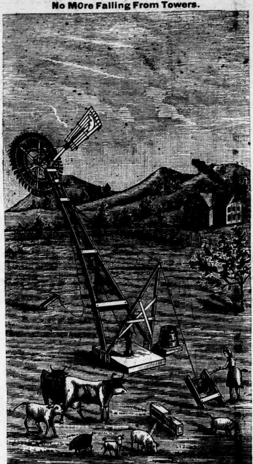
The "Addis" Mill and Two-Post Hinged Tower being lowered for the purpose of oiling or placing it out of the reach of the storm. It can be raised and lowered by a child.

If you want a mill or stock waterer send for our illustrated catalogue, terms and prices, and if our goods are not for sale by your local dealers we will make special introductory terms for the first mill or waterer ordered in any locality.