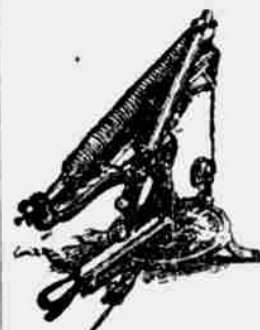
Our Expert Trap.