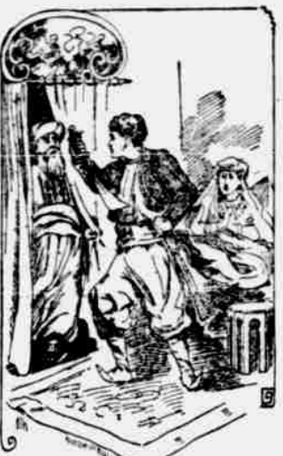
ENTERED THE SOCIAL DANCE.

After the accession of the present Emperor of Morocco, an officer in command of the fortress of Tetuan was executed for having plotted against his sovereign.