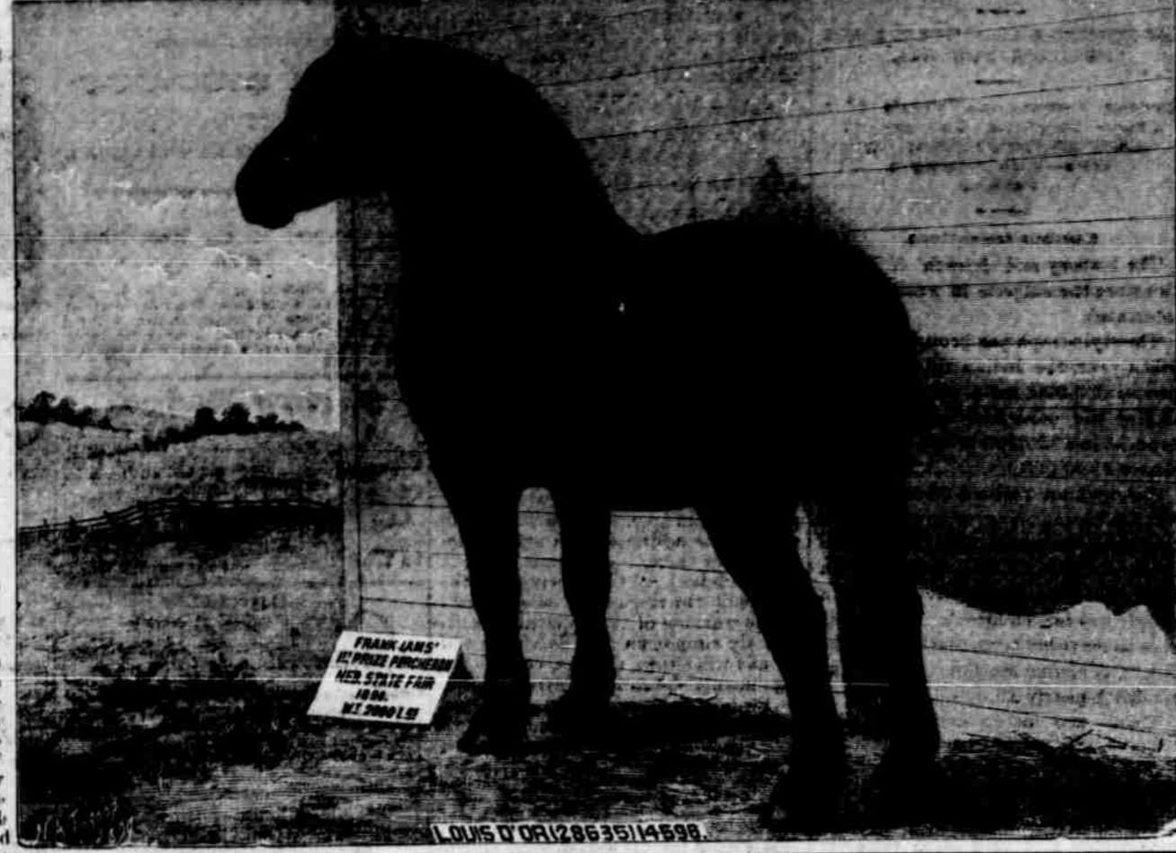
LOUIS D'OR 14566 14599

This week we present an illustration of the handsome black 3-year-old Percheron stallion prize winner "Louis D'Or," 14566 the creates such a sensation whenever brought into the show ring...