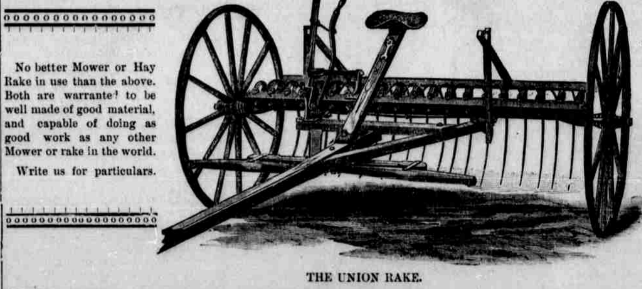
THE UNION RAKE.