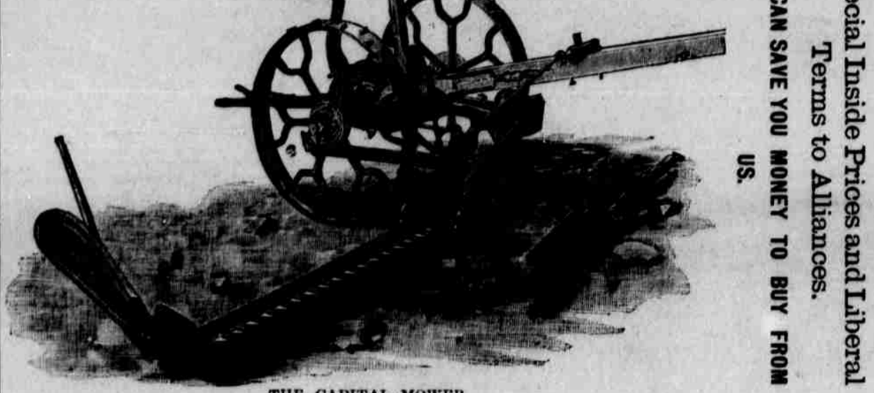
THE CAPITAL MOWER.