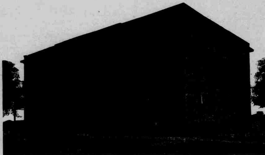
THE UNIVERSITY SCHOOL OF MUSIC, LINCOLN

Complete and thorough courses are offered in all principal branches of music, pianoforte, pipe organ, voice culture, violin, 'cello, brass and wood wind instruments, in harmony, counterpoint, composition, history, general theory, analysis, ear training, public school music, kindergarten methods and all modern languages. Students may elect any one or more of the above branches but the candidate