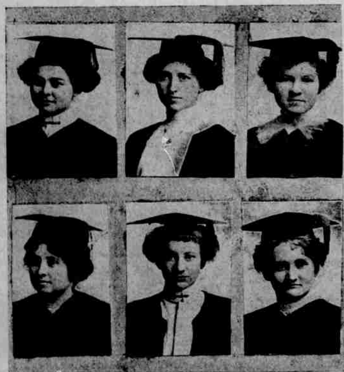
GRADUATING CLASS OF 1912, UNIVERSITY SCHOOL OF MUSIC