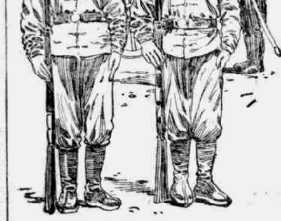
CHINESE IMPERIAL GUARDSMEN.

LANCASTER COUNTY EDITION THE CENSUS AND OTHER THINGS There has been considerable grumbling over the probable outcome of the census count in Lincoln this year. The final figures have not been given out, but none of those who are supposed to have inside information seem to think they will show forty thousand inhabitants. The last alleged census of Lincoln showed a population of about fifty-five thousand. The State Journal unbecomingly itself to the public at large and admits that census to have been stuffed.