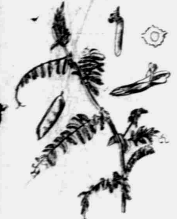
HAIRY OR SANDY VETCH.

The scientific name of this plant is Vicia villosa . A government report says of it: This annual leguminous plant is a native of Asia. It has been cultivated for about 10 years in some parts of Europe, especially southern Russia, Germany and France, and was introduced into this country for the first time about 1847 under the name of Siberian vetch. Excellent reports as to its drought-resisting qualities and its adaptability to our climate have been received from Washington, Nebraska, Georgia, New Mexico, South Dakota, Minnesota, Montana and Penn-