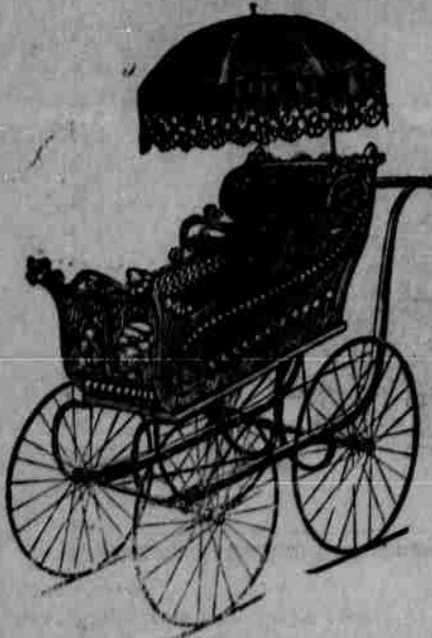
NEW STOCK, 50 different styles, from $4.00 to $30.00. Send for special Baby Carriage Catalogue.

Largest Stock . . . Furniture, Carpets and Hardware . . in the West.