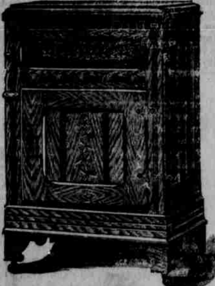
LEONARD'S HARD WOOD, Charcoal Filled Refrigerators from $4.00 to $30.00. Send for special catalogue.

If You Want Anything in the Furniture Line send for our New Spring Catalogue. We Prepay the Freight for 100 miles.