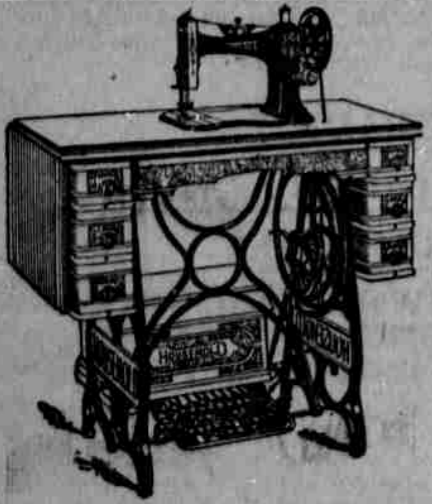
NEW HOUSEHOLD Sewing Machine, fully warranted; 2 drawers, $27.50; 4 drawers, $30; 6 drawers, $32.50.