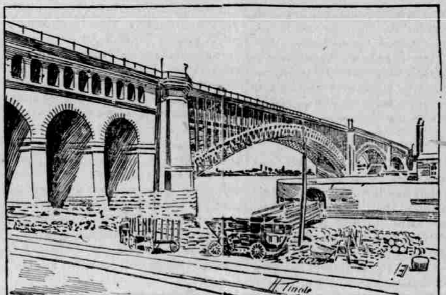
THE EAST END OF IT WAS CARRIED AWAY.

the water. Realizing that any moment his train might be blown into the water or else the bridge be blown away Scott, with rare presence of mind, put on a full head of steam in an effort to make the east side shore. The train had scarcely proceeded 200 feet and about the same distance from the shore when an upper span of the bridge was blown away. Tons of huge granite blocks tumbled to the tracks where the train loaded with passengers had been but a moment before. At about the same instant the wind struck the train, upsetting all the cars like playthings. Luckily no one was killed, but several were taken out severely injured. The