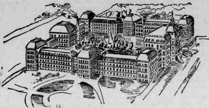
FILLED WITH INJURED VICTIMS OF THE CYCLONE.

stream. At the same moment the Dolphin's ropes parted, and the tug began to ship water. The wind blew her against the bridge. While this was going on the women and the other men on the boat climbed to the upper decks.