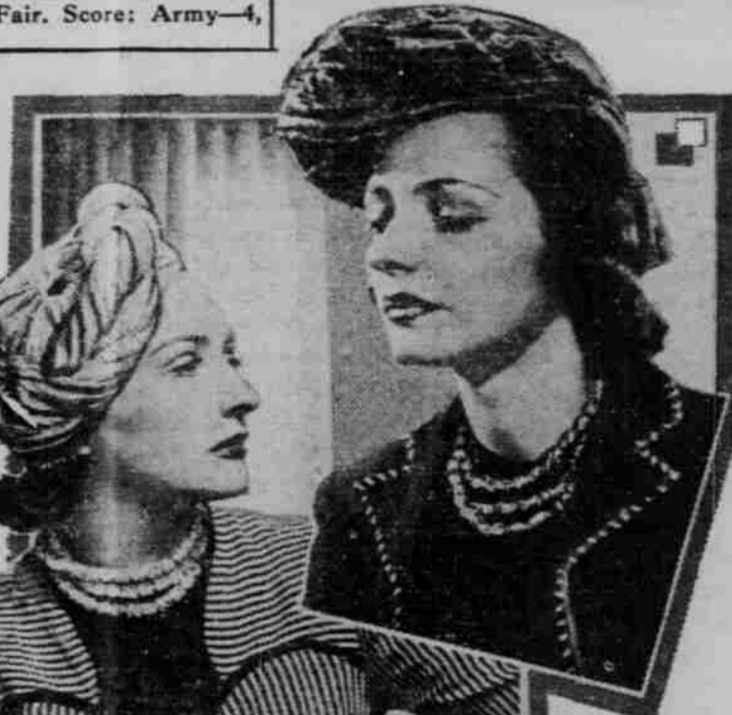
TURBAN FASHIONS —(Left) A flattering silk turban whose remarkable drapery is accentuated by the clever use of shirred eyelets to show the hair. (Right) A handsome Persian brocade with purplish red satin stripe predominating. The forward and upward swing are featured.