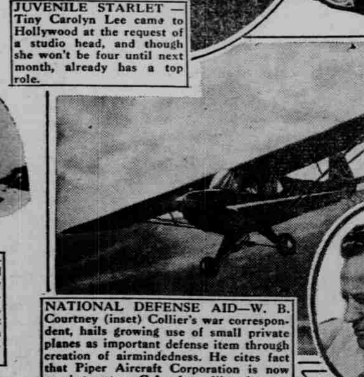
NATIONAL DEFENSE AID —W. B. Courtney (inset) Collier's war correspondent, hails growing use of small private planes as important defense item through creation of airmindedness. He cites fact that Piper Aircraft Corporation is now turning out a Cub plane like the one shown above every hour and ten minutes and will soon complete its 3,000th unit.