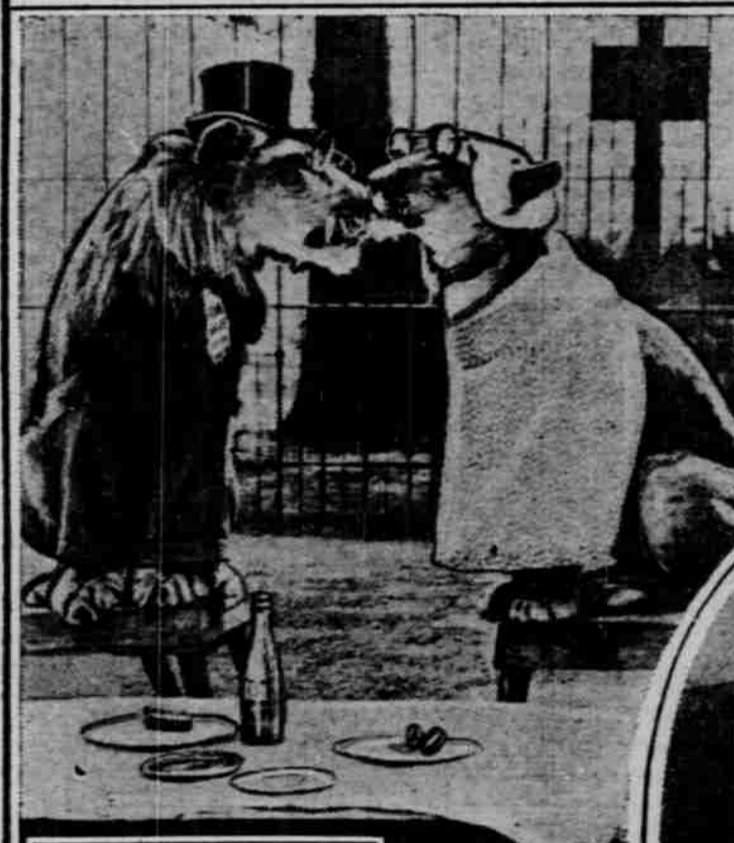
WEDDING AT THE ZOO —Los Angeles, Calif.—Dressed in their best clothes, Bobby and Betty, 3-year-old lions at Zoo Park, engage in a little billing and cooing, before enjoying their breakfast.