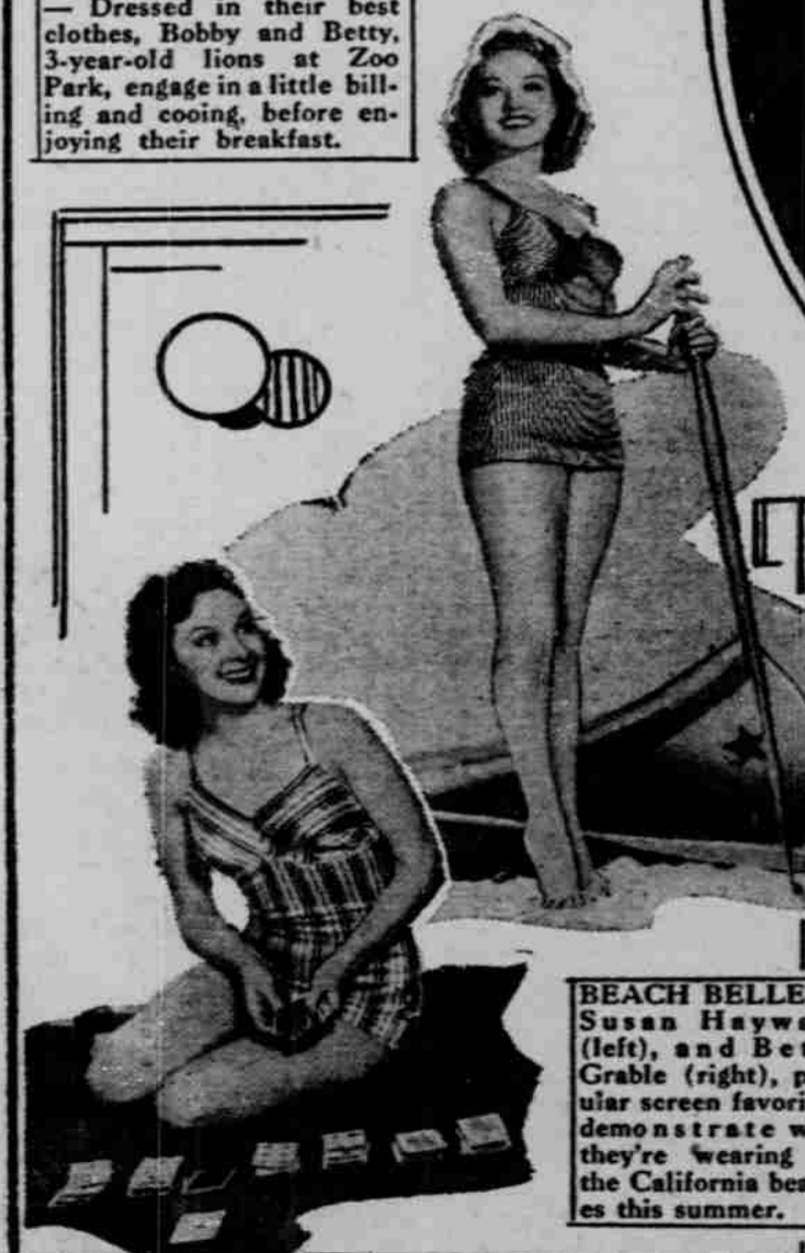
BEACH BELLES —Susan Hayward (left), and Betty Grable (right), popular screen favorites, demonstrate what they're wearing on the California beaches this summer.