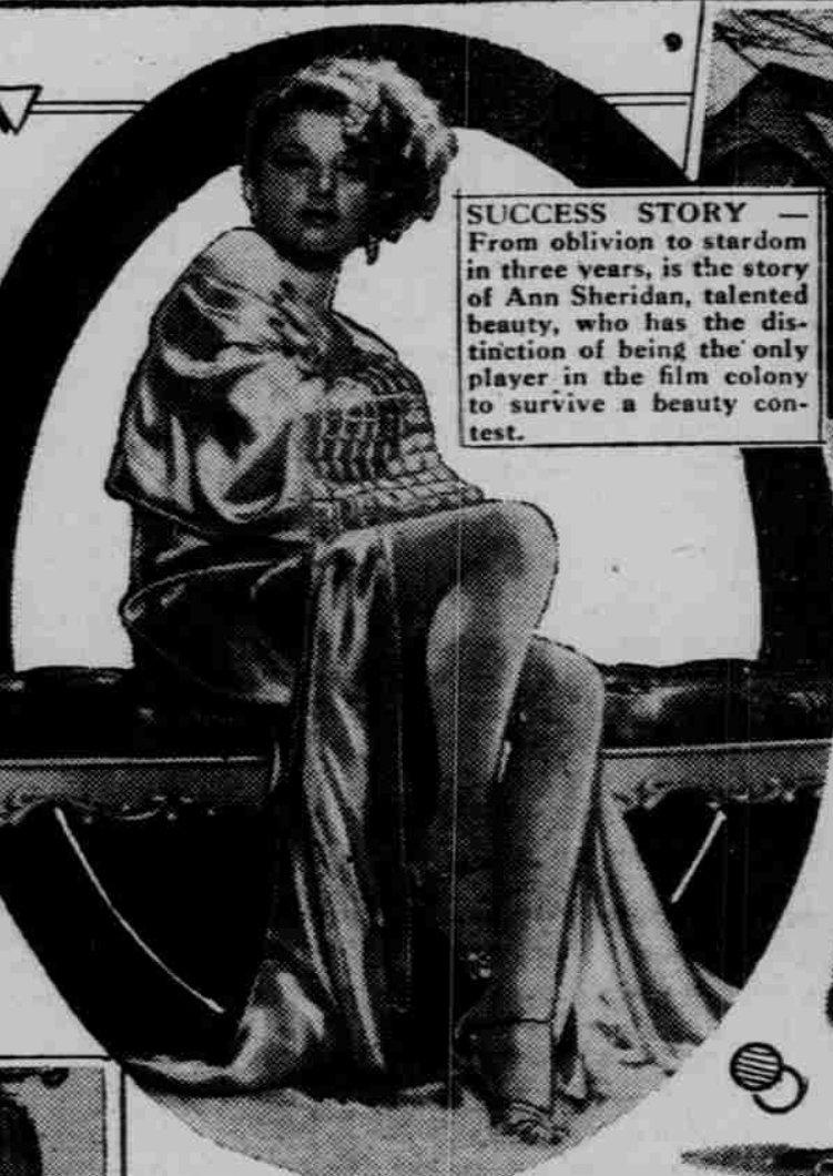
SUCCESS STORY From oblivion to stardom in three years, is the story of Ann Sheridan, talented beauty, who has the distinction of being the only player in the film colony to survive a beauty contest.