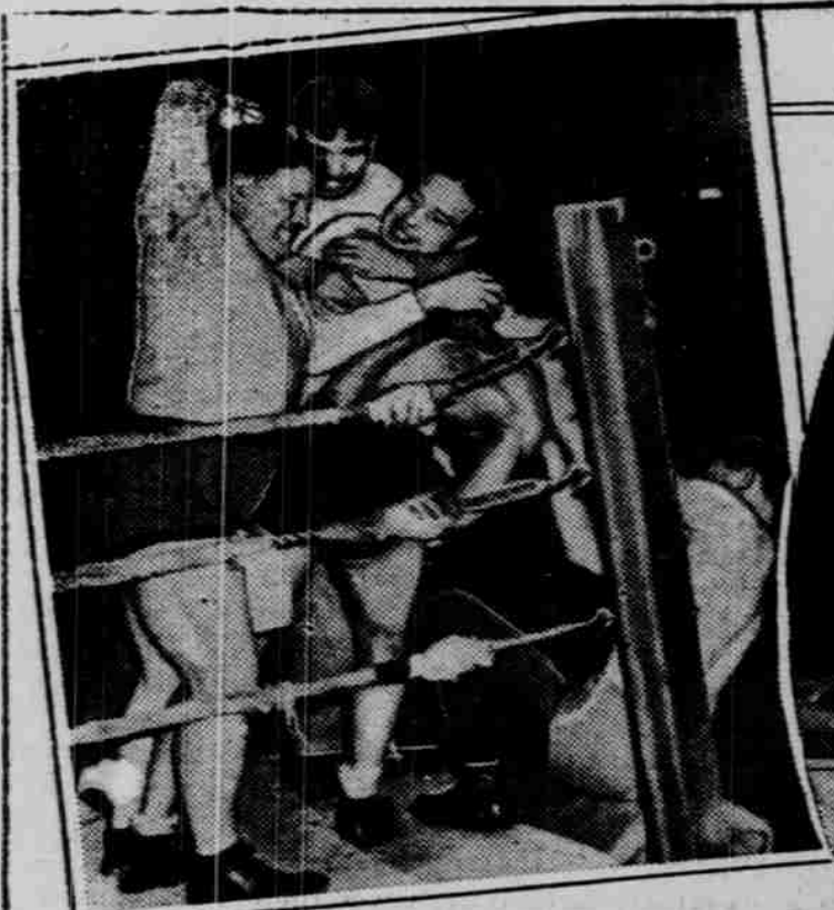
BOXER TANGLES WITH WRESTLERS—Springfield, Mass.—When a boxer tangles with a ring full of wrestlers, this is the result. The boxer is Max Baer—who was supposed to referee this free-for-all.