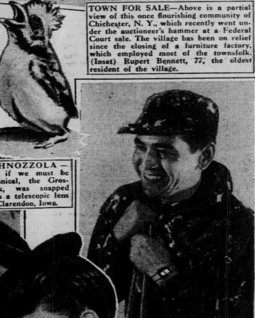
The well-dressed young skier braves Sun Valley's snow in a windbreaker of strong, lightweight cloth. For perfect timing in a sport where timing can make the difference between life and death he wears one of the new Gruen Veridish watches, designed to be as slim and sturdy as the lacquer red ski poles on which he rests. His jacket and cap a navy blue, and a navy hood can be pulled over his head when there's an extra nip in the air.