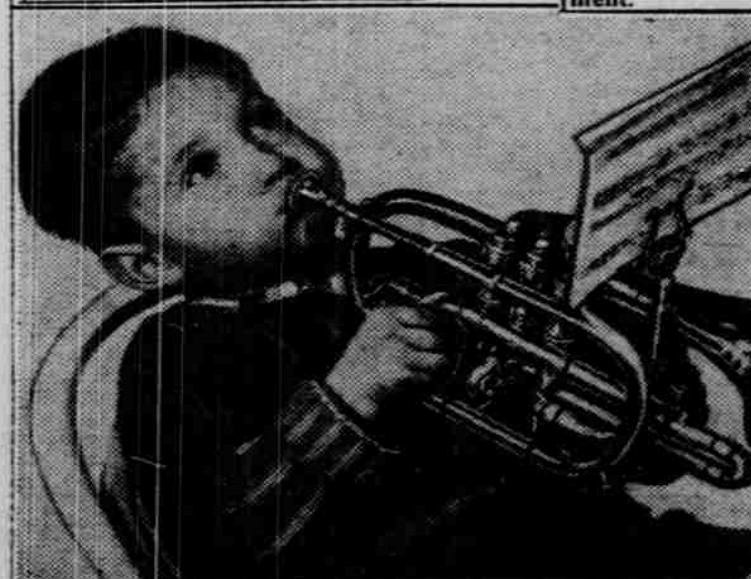
GETTING UP WIND—And it looks as if Daddy's trumpet will get him down before he'll get enough wind up.