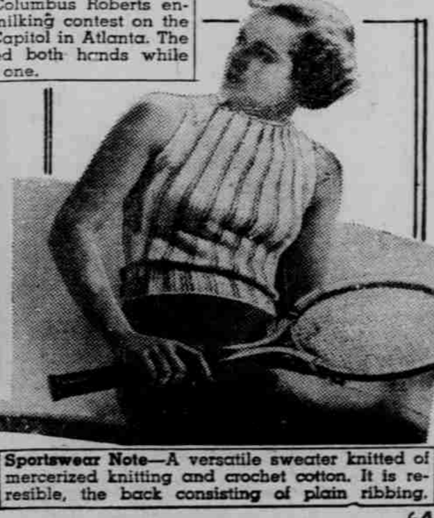
Sportswear Note— A versatile sweater knitted of mercerized knitting and crochet cotton. It is reversible, the back consisting of plain ribbing.