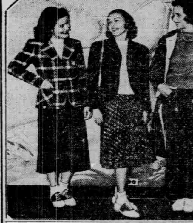
For Campus Wear— Some of the smart collegiate wear that was displayed in the college fashion show held recently in New York. Left to right: An odd jacket and tweed skirt, a plaid skirt and Sutherland tweed jacket, and a reversible corduroy coat with slacks to match.