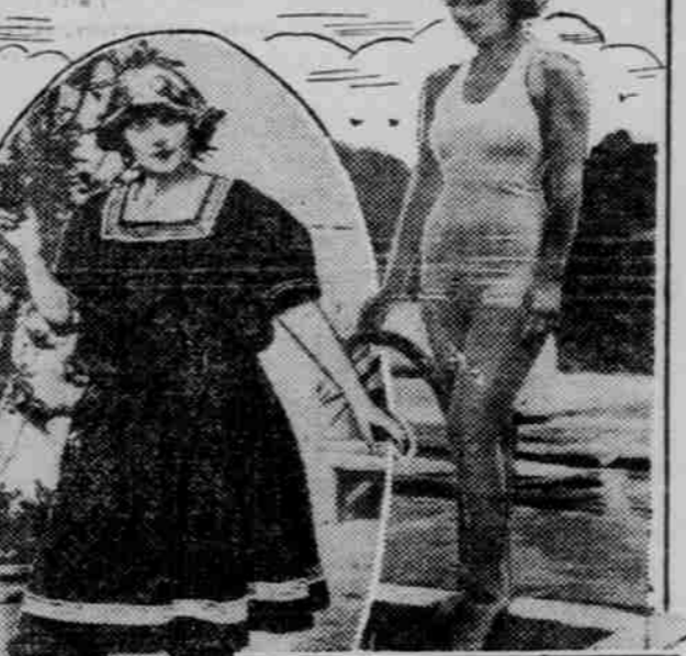
Bathing Beauties— Only a generation apart. Clothing designers, as well as industrial designers, have helped to change our ways of life in the past quarter century, as these pictures show. Consumers Information uses the photographs to demonstrate how national advertising has altered the habits of a nation—and we think you'll agree it's for the better.