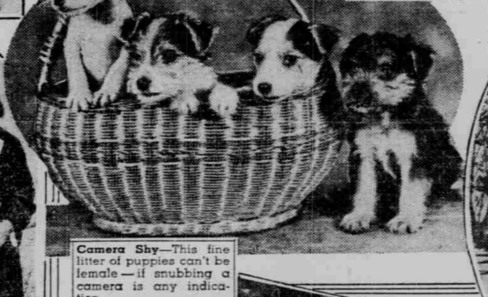
Camera Shy— This line litter of puppies can't be female—if snubbing a camera is any indication.