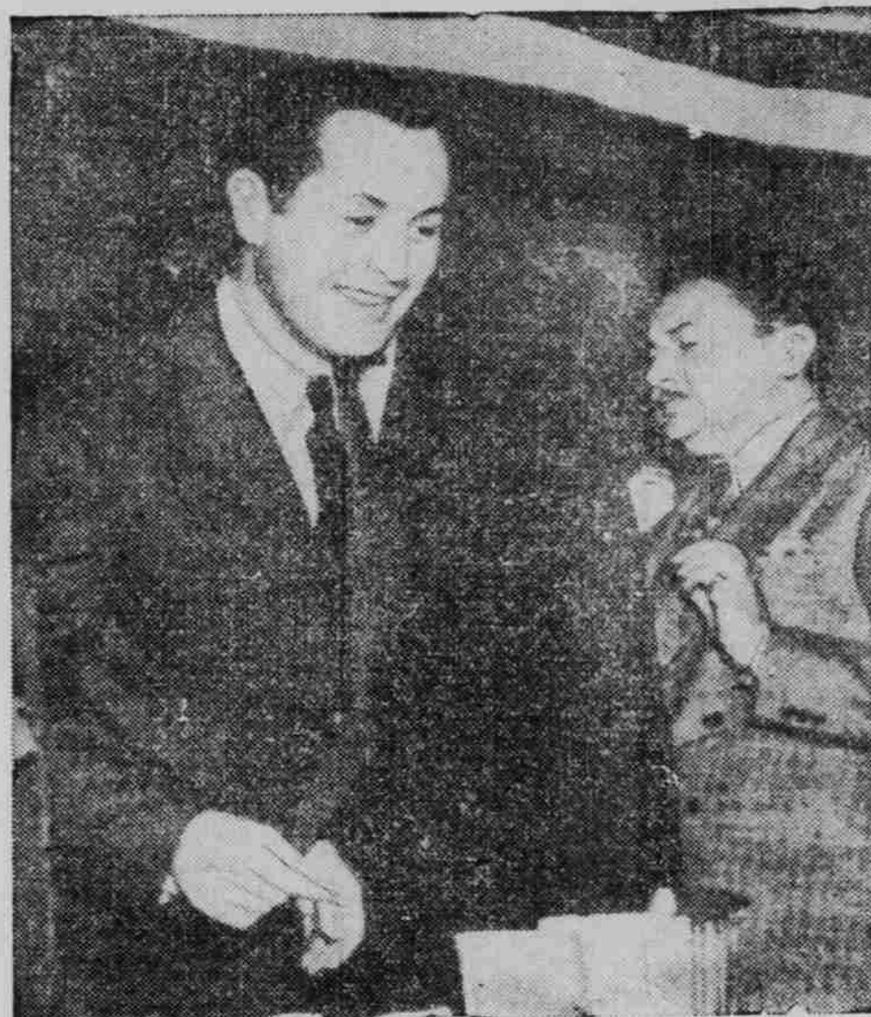
Robert Montgomery Jean Hersholt

Threatened walkout of 4,000 Hollywood actors and actresses was averted when Robert Montgomery, president of the Screen Actors guild, announced at a mass meeting of 4,000 members that six major producers had agreed to accept the "guild shop" proposal. Montgomery is shown above, left, addressing the meeting. Jean Hersholt, another prominent actor, appears at the right.