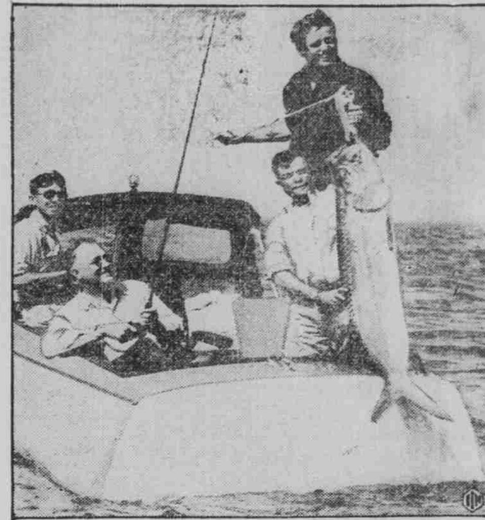
Fishing in gulf waters

President Roosevelt proved his prowess as a fisherman when he caught this sizable tarpon—weighing 77 pounds—in the waters of the Gulf of Mexico off Port Aransas, Tex. Elliott Roosevelt, son of the president, is holding the fish.