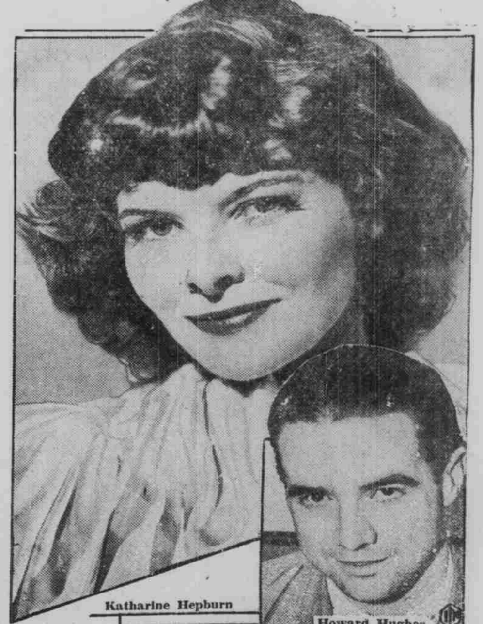
Katharine Hepburn Howard Hughes When Howard Hughes, ace airman and wealthy sportsman, flew to Chicago from New York after setting a new transcontinental air record, his trip gave credence to reports that he was joining Miss Katharine Hepburn at the altar there.