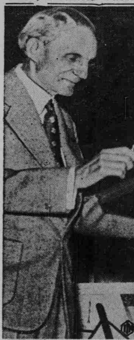
Henry Ford One of the few radio appearances made by Henry Ford, motor magnate, above, occurred when he formally presented to the city of Dearborn, Mich., a wooded tract to be used for park purposes.