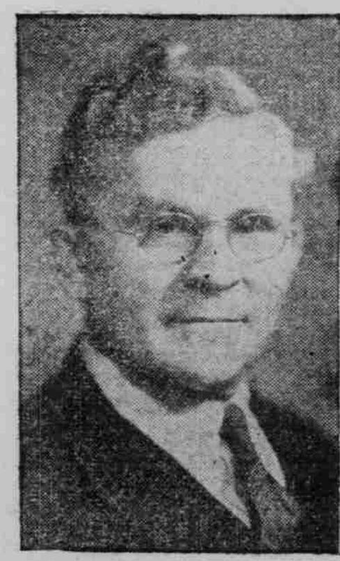
DEWOCRATIC CANDIDATE FOR