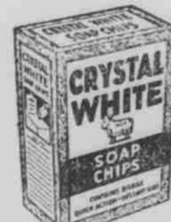
The large 21oz. package