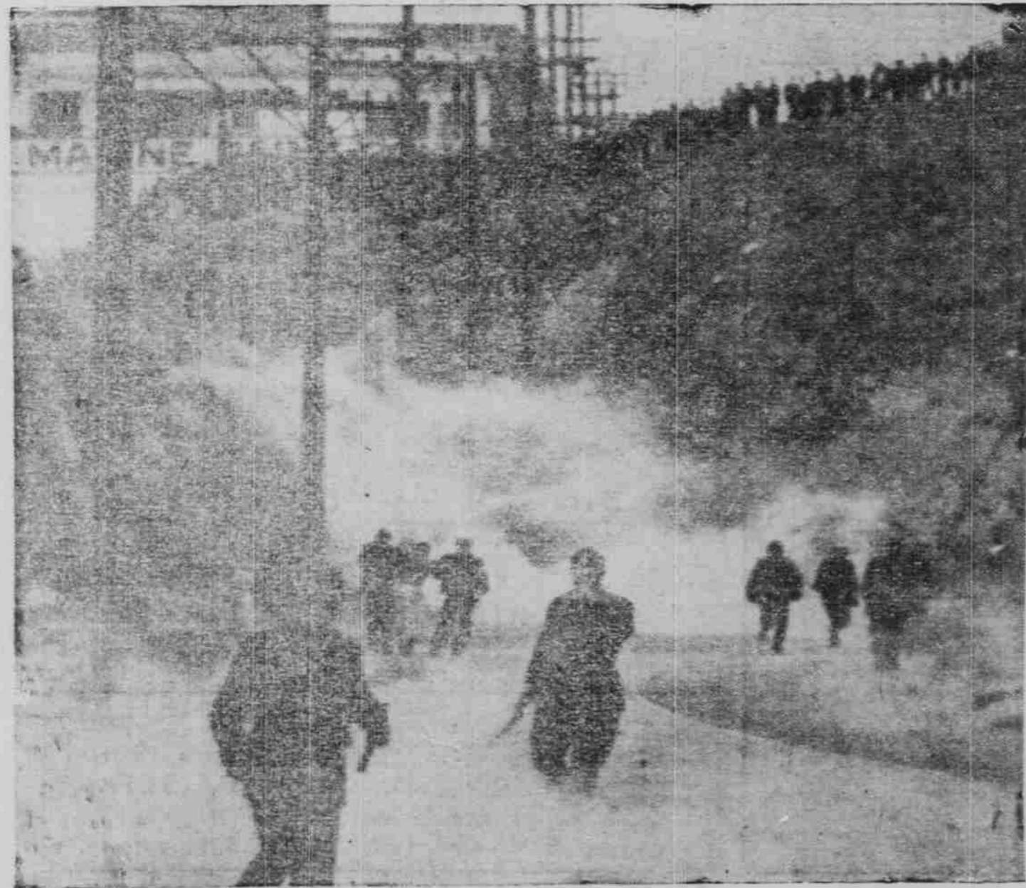
Three thousand strikers, massed on the slopes of Rincon Hill, San Francisco, saw the State Belt Line Railroad operating under heavy police guard on the hill into the ranks of the strikers. This photo shows what resulted—a dramatic reminiscence of actual warfare. Helmeted through clouds of their own tear gas, grappling with or chasing pickets into a pocket at the base of Rincon Hill. This charge resulted in a riot in which many others wounded with clubs and scores more battle, one of many that occurred throughout the Governor of California, Frank E. Merriam formal declaring that "tumult and rioting" prevails in the city of San Francisco. The troops are scheduled to take over the waterfront war zone tonight (July 5).