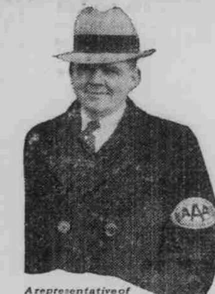
the AAA Contest Board, vigilant, unbiased investigator.