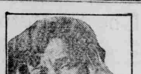
"Nerves" A night of broken rest followed by hours of mental or physical strain; nerves tensed almost to the breaking point; irritable; unable to concentrate—another hectic night and miserable day ahead of you.

NOTICE. Notice is hereby given that the Legislature of Nebraska by an act passed by a three-fifths vote of the members elected to each house.