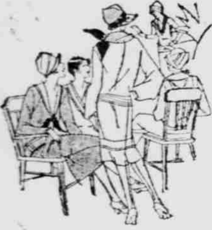
From the diary of Enna Jettick