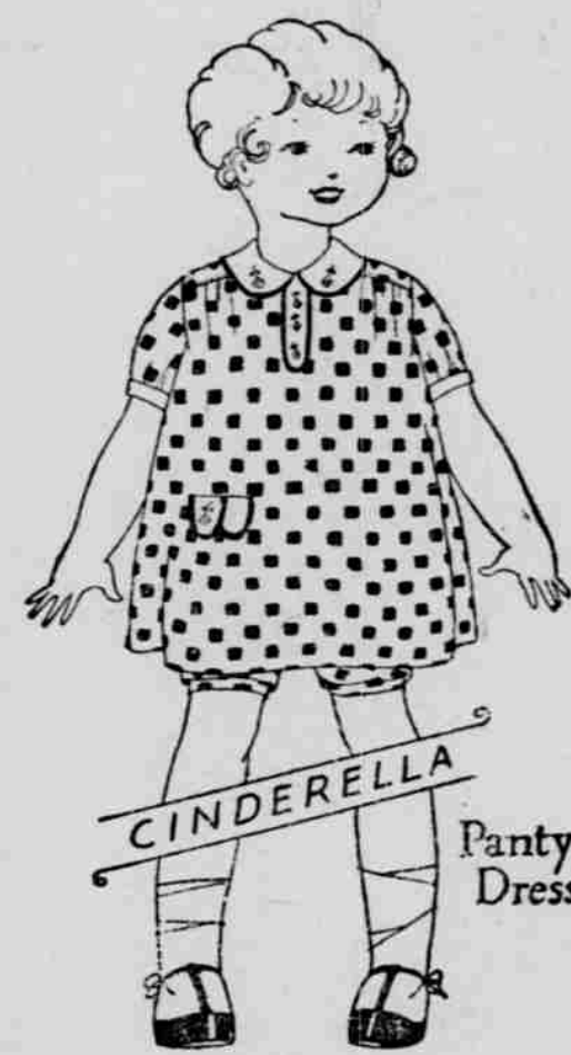
CINDERELLA Panty Dress