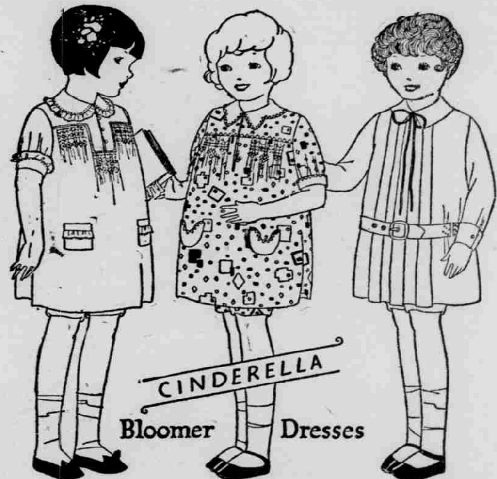
CINDERELLA Bloomer Dresses