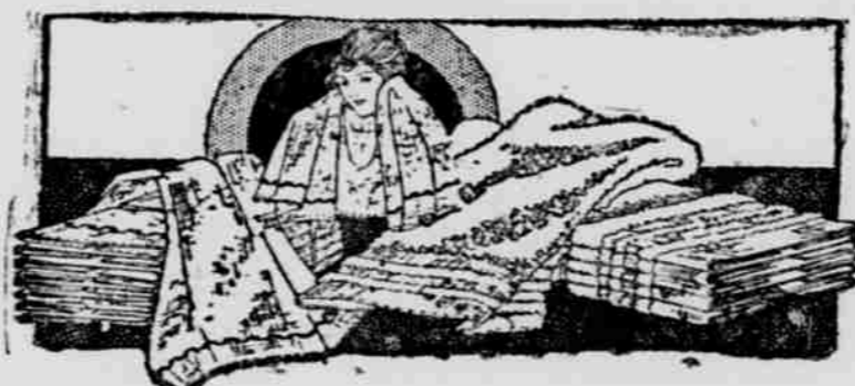
Table Linen! Table Oil Cloth!

It is in the every day materials especially that you'll notice the savings we offer.