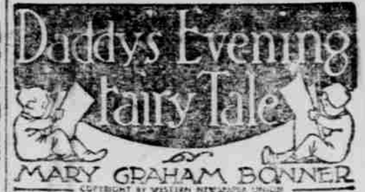
MARY GRAHAM BONNER