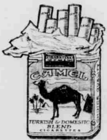
R. J. REYNOLDS Tobacco Co. Winston-Salem, N. C.

Give Camels a tryout. Buy a pack today. Get your information first hand. You'll tie to Camels, too.