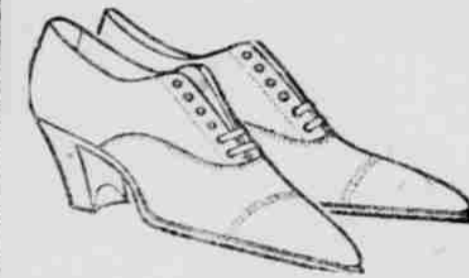
Ladies' Brown Kid Oxfords

a new shipment of Ladies' Low Shoes and Men's Tan English Oxfords.