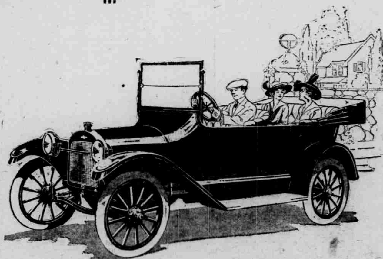
Chevrolet Model "Four-Ninety" Touring Car, $820

Additional "Four-Ninety" Models: Roadster, $790; Sedan, $1375; Coupe, 1225; Light Delivery Wagon (one seat) $820; Chassis, $770 All prices f. o. b. Flint, Mich.