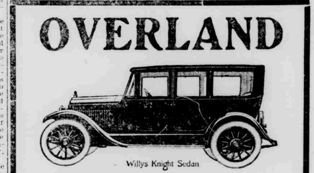
Willys Knight Sedan