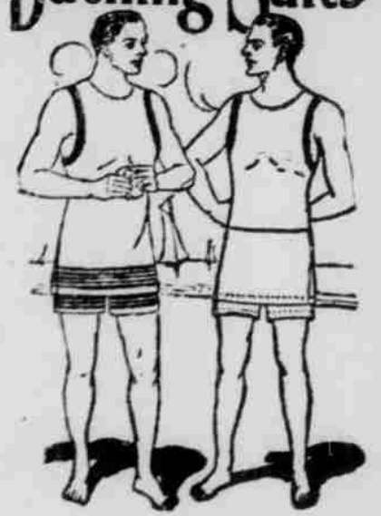
Coney Island Bathing Caps—very nifty