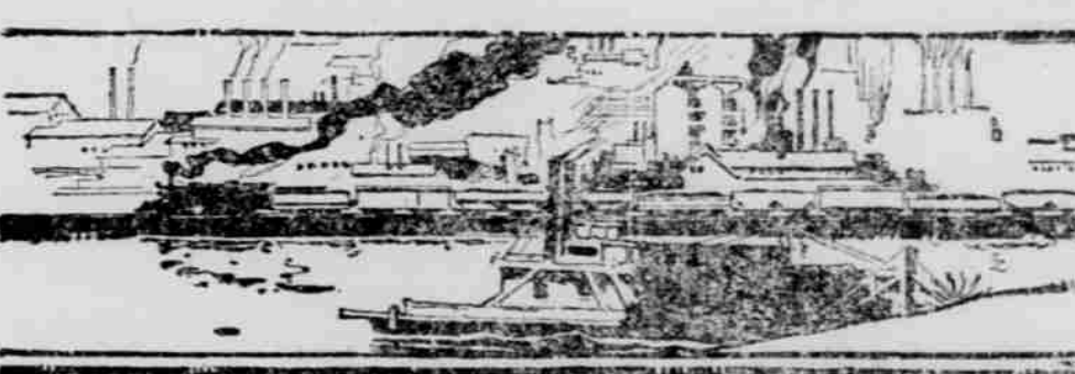
Those desiring information concerning the railroad situation may obtain literature by writing to The Association of Railway Executives, 61 Broadway, New York

This advertisement is published by the Association of Railway Executives