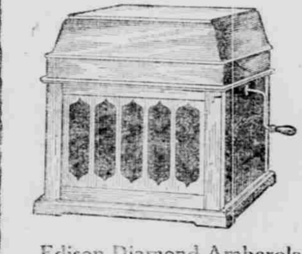
Edison Diamond Amberola

Musical lovers of Plattsmouth are most cordially invited to attend demonstrations of the New Edison which will be given daily in our Edison Department.