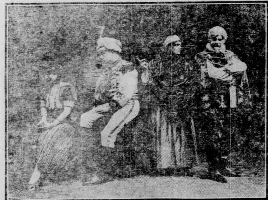
DAVENNY FESTIVAL QUINTET.

Scat Sale at Weyrich & Hadraba's Monday at 7:30 p. m.