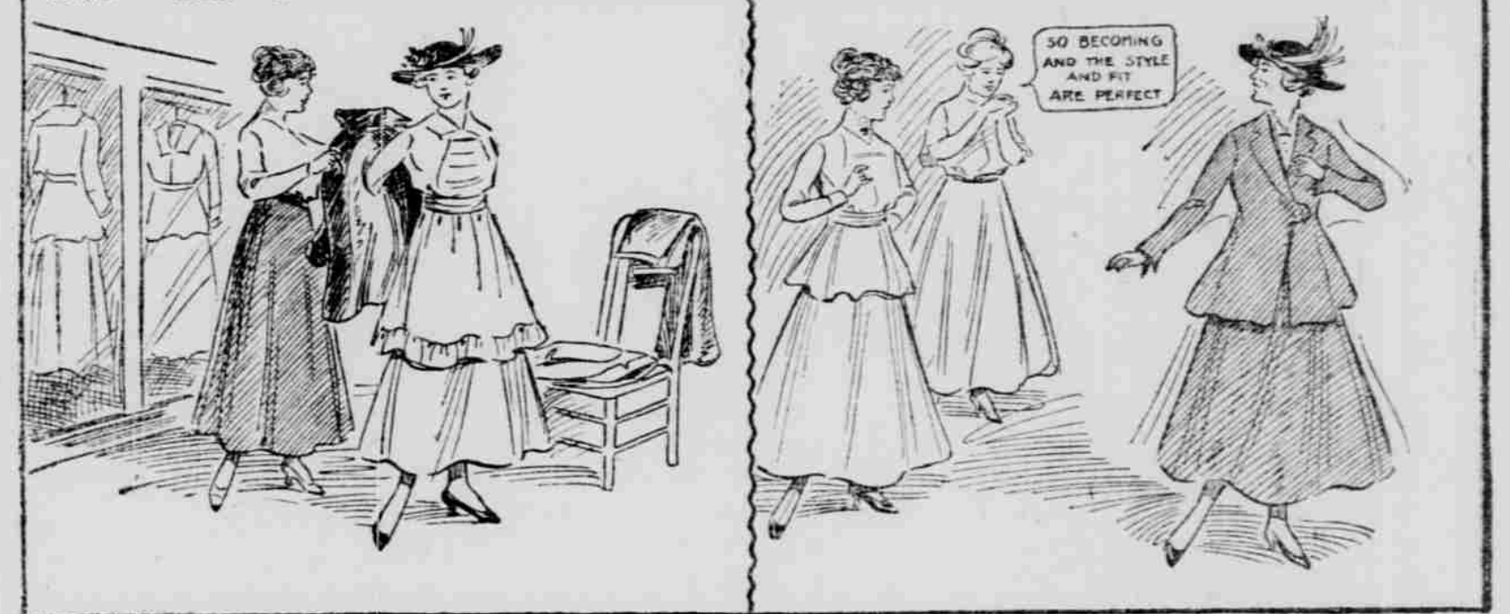
(Copyright, 1916, by H. C. Tuttle.)

COMPARED TO A PROCESS QUICK, PRACTICAL AND SATISFACTORY SEE - FEEL - COMPARE - BUY TO-DAY - GET IT - USE IT - PROVE IT - TOMORROW.