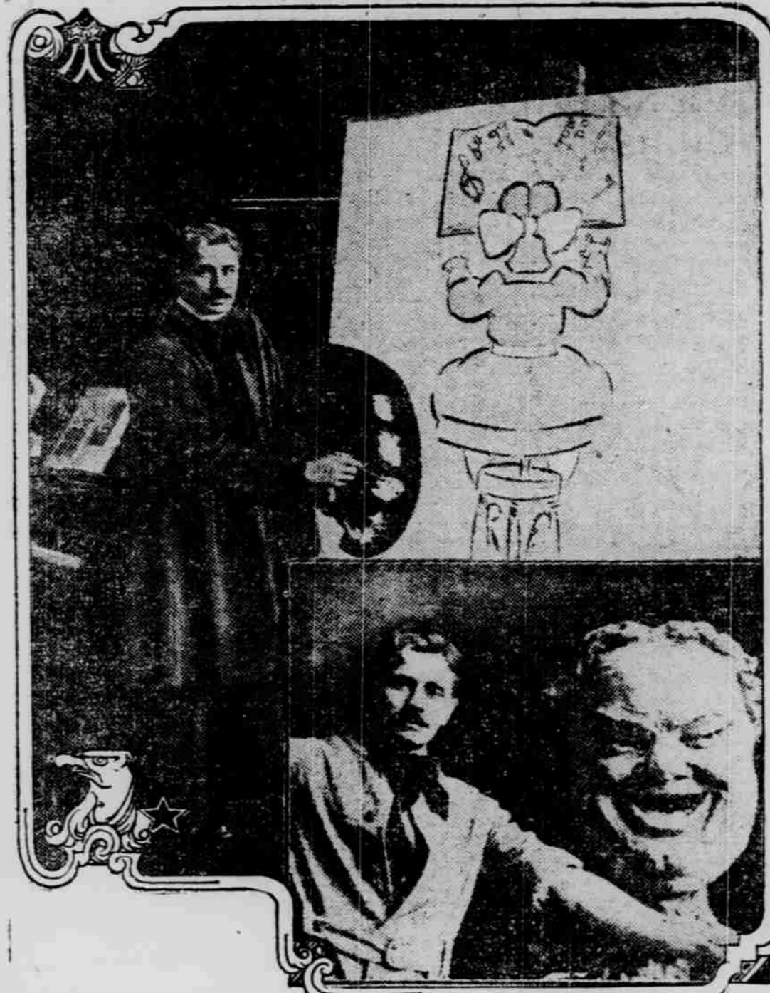
CHAUTAUQUA PATRONS TO WITNESS WORK OF NOTED CARTOONIST AND CLAY MODELER.