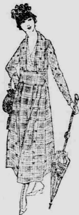
McCall Pattern No. 2787. Many other attractive designs for sale.