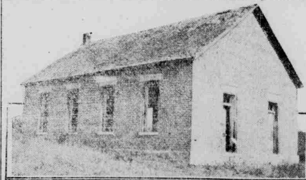
METHODIST CHURCH AT ROCK BLUFFS.