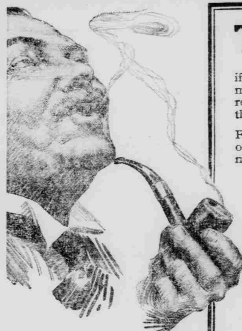
Copyright 1916 by R. J. Reynolds Tobacco Co.