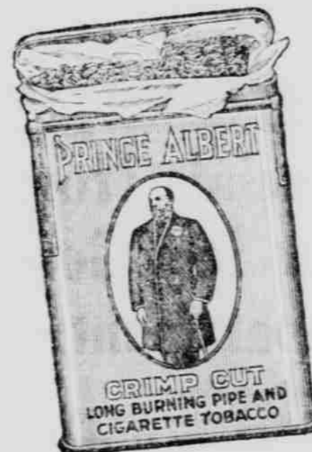
On the reverse side of this tidy red tin you will read: "Patented July 30th, 1907," which has made three million smoke pipes where one smoked before!