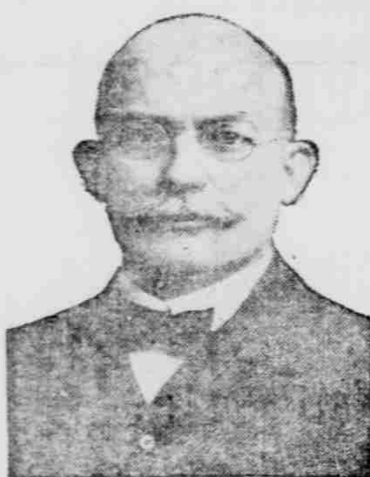
MAYOR CHARLES W. BRYAN Democratic Candidate for Governor

R. J. REYNOLDS TOBACCO CO., Winston-Salem, N. C.